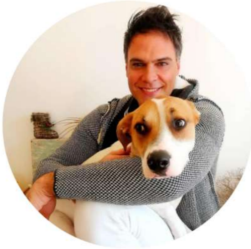
Hoolie Pet Insurance's Ambassador

// Your pet is also your family! So, to ensure it's safety and well being is your responsibility and with Hoolie you can achieve both!