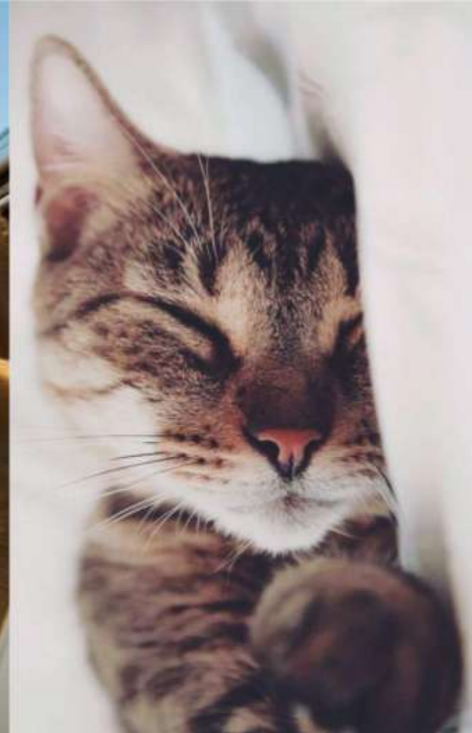
Love Me Back